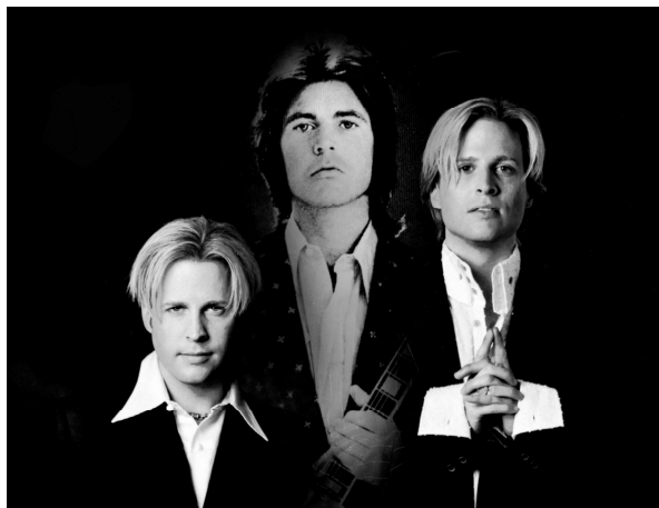
At the Silver Bowl